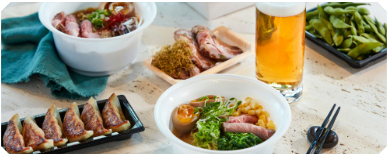
Images displayed are for representation purpose only. Actual product may differ.

ENJOY 10% OFF WHEN YOU ORDER VIA CALL-IN (604.336.5563)